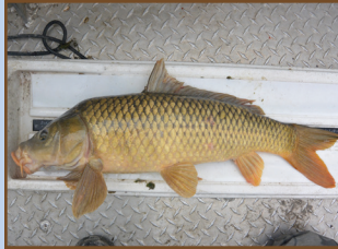
Common Carp with LONG dorsal fin and LARGE SCALES