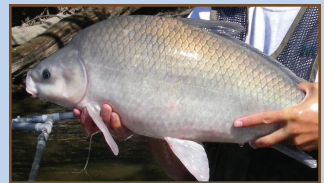
Smallmouth Buffalo with DEEP body