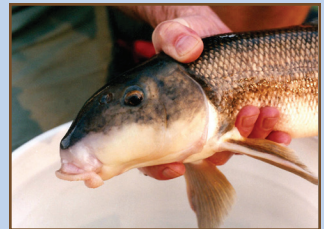
Sucker species (e.g. White Sucker, pictured) with SUCKER mouth and NO BARBELS (whiskers). Eyes sit high on the head