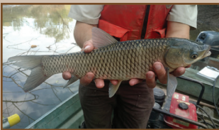
INVASIVE Grass Carp with SLENDER head and body

Asian Carps Regional Coordinating Committee