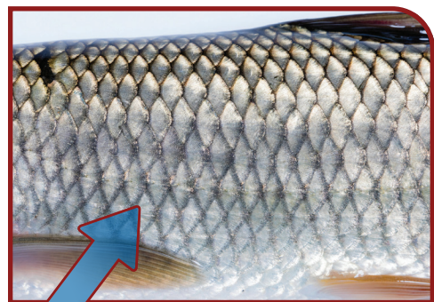
Asian Carp Regional Coordinating Committee

Grass Carp have a JAWED mouth and do NOT have a SUCKER mouth