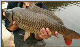
Common Carp with DEEP body