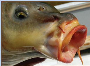
Common Carp with SUCKER mouth and BARBELS (whiskers). Eyes sit relatively high on the head