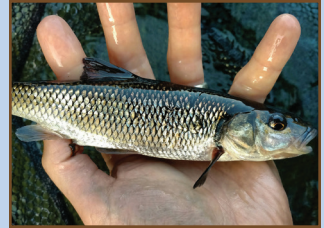
Fallfish with SHORT dorsal fin and MODERATE SCALES. Eyes sit relatively high on head