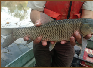
INVASIVE Grass Carp with SHORT dorsal fin and LARGE SCALES

Asian Carps Regional Coordinating Committee