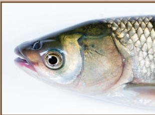
INVASIVE Grass Carp with JAWED mouth and NO BARBELS (whiskers). Eyes are low and sit in line with mouth

Asian Carps Regional Coordinating Committee